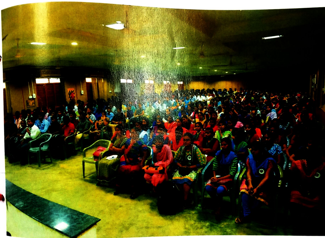
YOUTH MOTIVATION PROGRAM HELD ON 15.9.19

Approved by AICTE and Affiliated to Anna University ☎ 24801636, 24732488