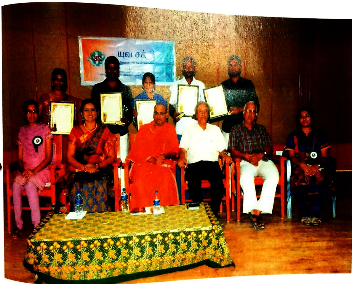
YOUTH ACHIEVER AWARD DISTRIBUTION PROGRAMME HELD ON 15.5.19

MEENAKSHI SUNDARARAJAN ENGINEERING COLLEGE (Managed by I.I.E.T Society) 363, Arcot Road, Kodambakkam, Chennai – 24 Approved by AICTE and Affiliated to Anna University ☎ 24801636, 24732488