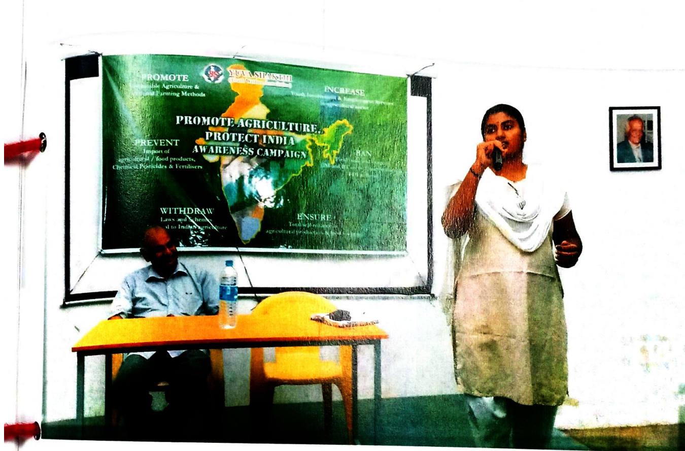
YOUTH MOTIVATION PROGRAM ON AGRICULTURE HELD ON 25.4.2017

Approved by AICTE and Affiliated to Anna University ☎ 24801636, 24732488