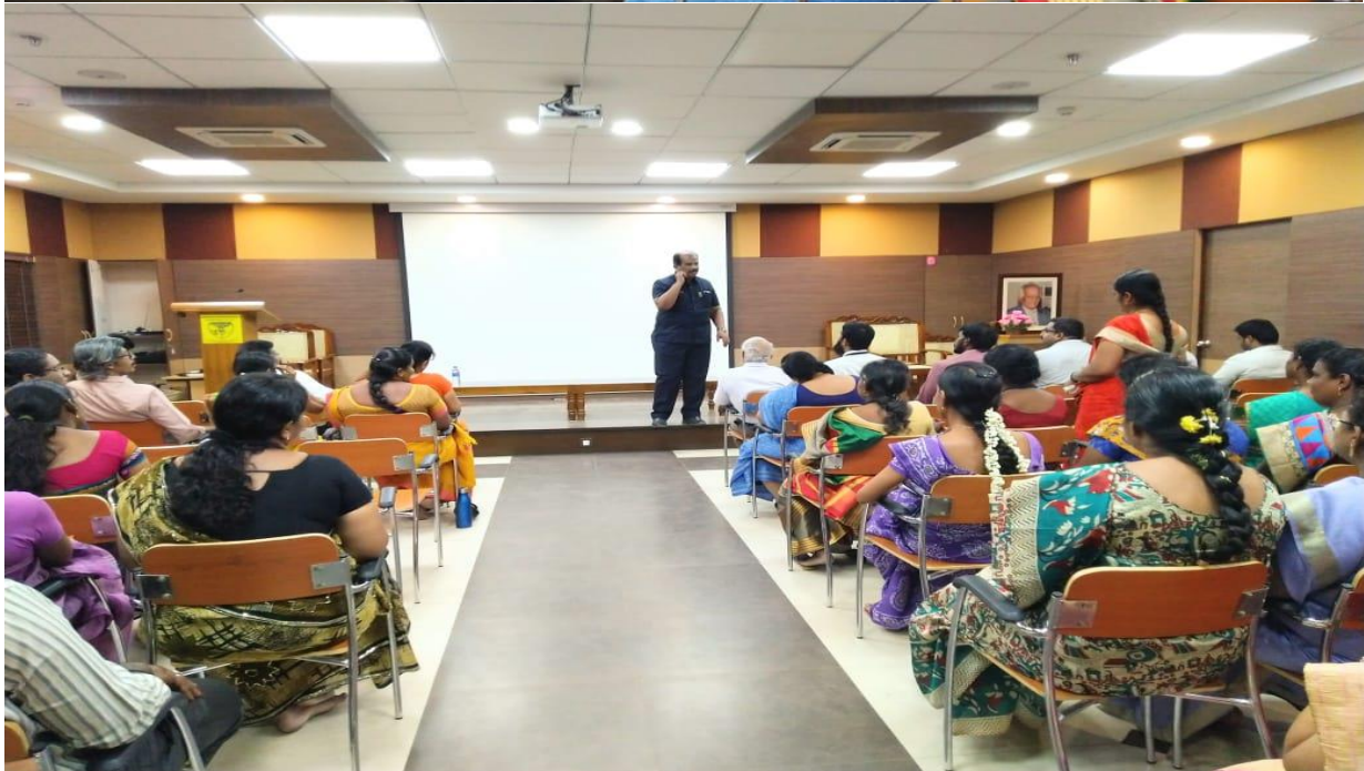
Photograph taken at 19/09/2019