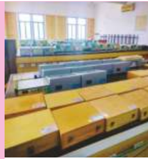
COMMUNICATION SYSTEMS LAB