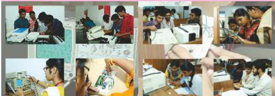
STUDENTS WORKING ON PROJECTS