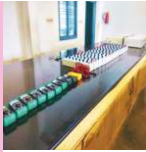
DIGITAL ELECTRONICS LAB