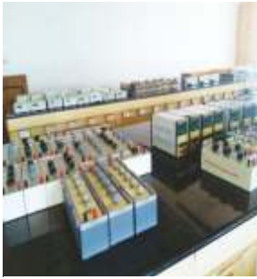
ELECTRONIC DEVICES AND CIRCUITS LAB