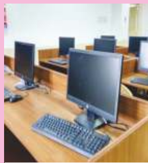
PROJECT AND SIMULATION LAB