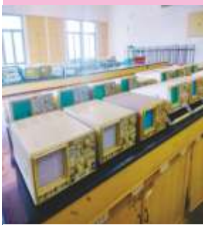
OPTICAL AND MICROWAVE LAB