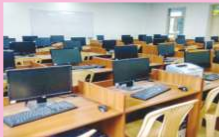
VLSI AND DSP LAB