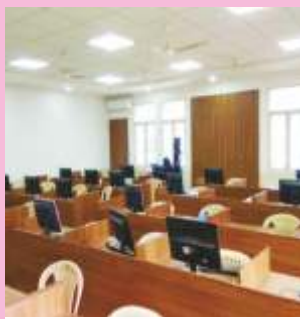
MICROPROCESSOR AND MICROCONTROLLER LAB