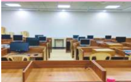
LINEAR INTEGRATED CIRCUITS LAB